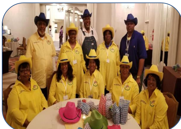
Waiting on the Rodeo – DC Style